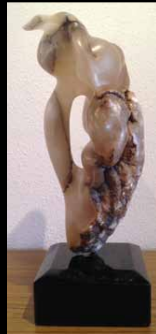
Calla Light by Victor Picou